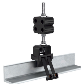
Threaded Rod Adapter with Universal Angle Adapter base 900639-10