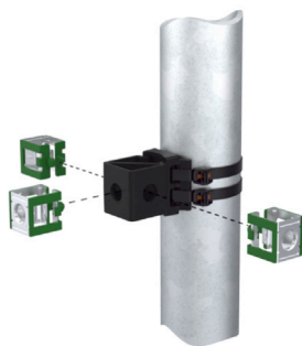
Snap-in Adapter with Universal Round Member base 900638-10