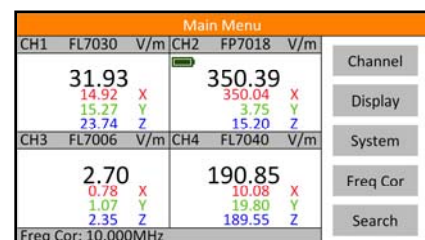
Multi-probe X,Y,Z Display