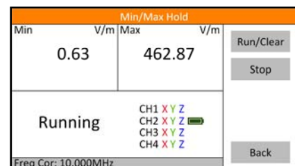
Min/Max Hold Display

AR RF/Microwave Instrumentation 160 School House Rd Souderton, PA 18964 215-723-8181