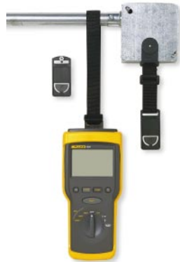
Optional TPAK Meter Strap and Magnet Hanging Kit