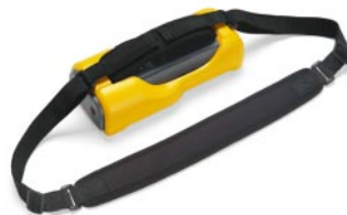
Optional SH 100 Shoulder Strap

Fluke. Keeping your world up and running.