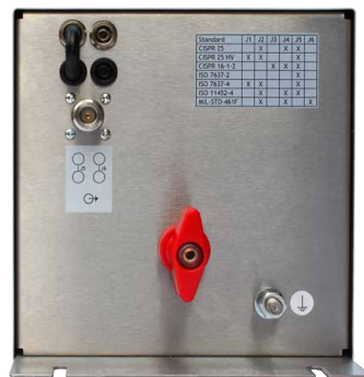
HV-AN 150, view to the EUT port