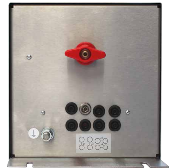
HV-AN 150, view to the AE port

Teseq GmbH Landsberger Str. 255 · 12623 Berlin · Germany T +49 30 56 59 88 35 F +49 30 56 59 88 34 deinfo.teseq@ametek.com www.teseq.com