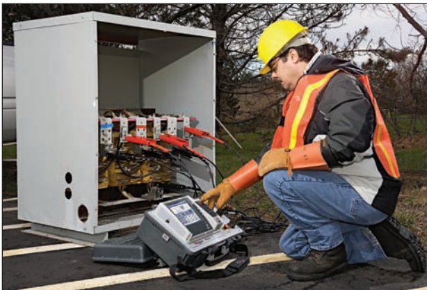
TTR330 shown testing a pad mount three-phase transformer