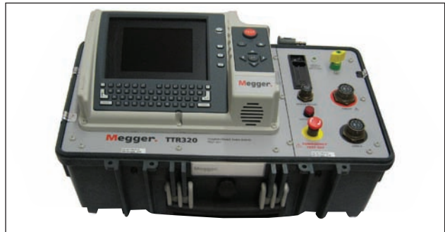
TTR320 — graphical ICON based user interface unit