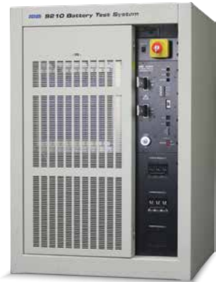
9210 Single Channel Test System

The 9210 Series test system is a single channel version of the popular 9200 family of test systems. The small footprint makes it easy to move within engineering or manufacturing environment thereby allowing it to be brought to the unit under test (UUT) or into an engineers workspace.