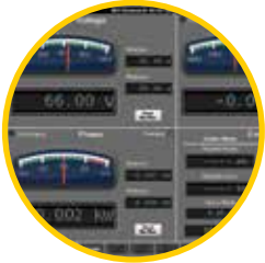
Figure 2 - PowerPanel Software

Each 9210 system is supplied with an internal controller pre-configured with PowerPanel software (Fig. 2) and an installation CD that contains: a second PC-Based version of PowerPanel, fully documented drivers including samples and tutorials (Fig. 3), and a complete LabVIEW VI Library (Fig. 4). NH Research offers Enerchron® Test Management Software (Fig. 5) as a separate software package which designed to simplify test creation, execution, data collection and analysis of test sequences such as drive cycles or those tests which require additional test equipment such as chambers or data acquisition.