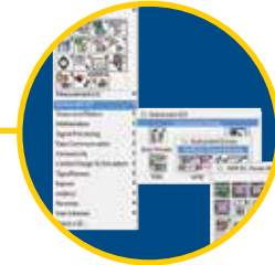
Figure 4 - Complete LabVIEW VI Library