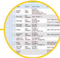
Figure 5 - Enerchron® Test Management Software