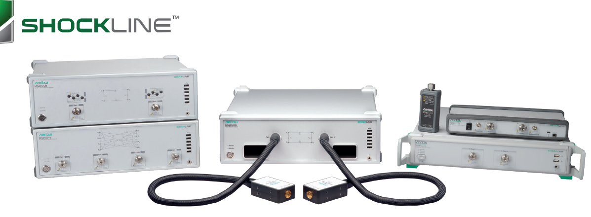
ShockLine Vector Network Analyzer Family