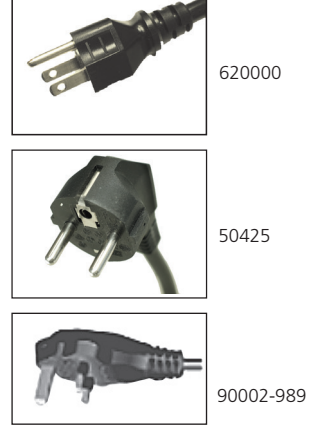
TABLE OF ACCESSORIES

Accessories are supplied with the selection of the various features depending upon the option selected . Test Leads and Accessories can also be ordered individually, see below for accessories included with option and part numbers.