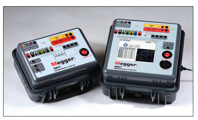
The MRCT is available in 2 onboard display/enclosure options.

Industry leading test duration using patented simultaneous multi tap measurements - The MRCT system can provide concurrent measurement of voltages on all taps during CT saturation, and ratio and polarity testing. This allows the MRCT system to calculate the knee points and ratios of all windings at the same time thus eliminating the need for multiple tests on a CT. This will drastically reduce testing time.