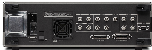
SR810/830 rear panel