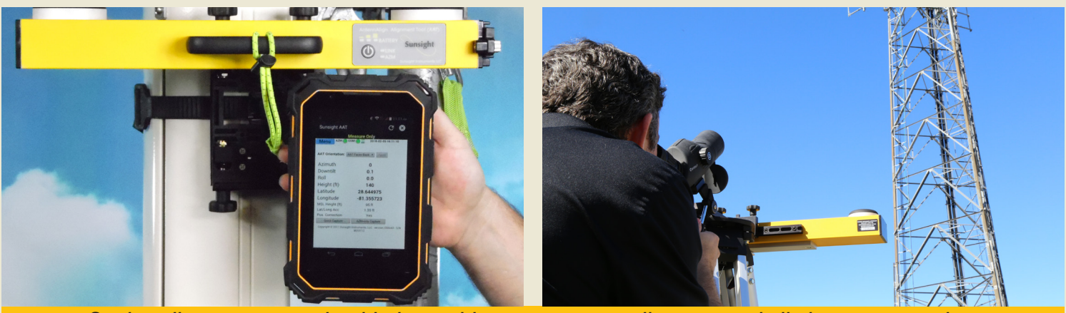
Setting alignment correctly with the worlds most accurate alignment tool eliminates return trips.