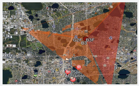
Simulate Boresight Radiation Patterns Based on Azimuth and Tilt