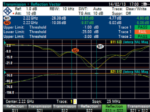
Simultaneous display of four S-parameters (S11, S21, S12, S22).