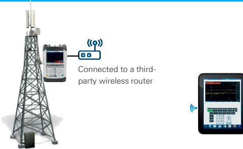
Tablet with R&S®MobileView apps (available for Android and IOS) to remote control the analyzer.