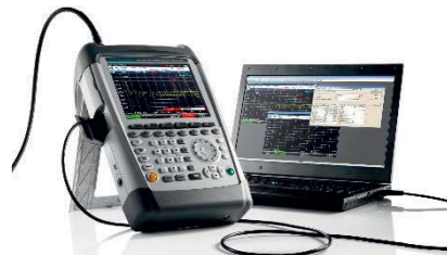
The R&S®ZVH can be remotely controlled via the USB or LAN interface and integrated into user-specific programs.