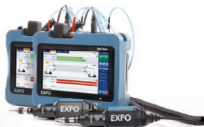
MaxTester 940 Fiber Certifier OLTS